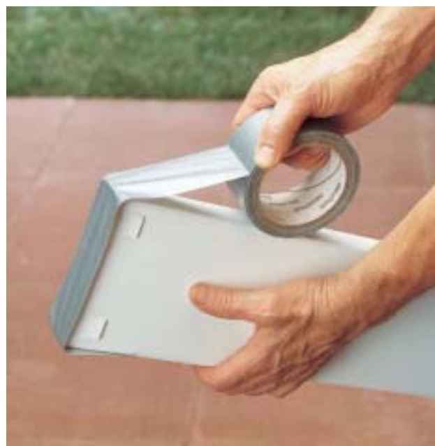
A. Place tape over the ends of the lower stringers so concrete cannot seep into them from the posts.